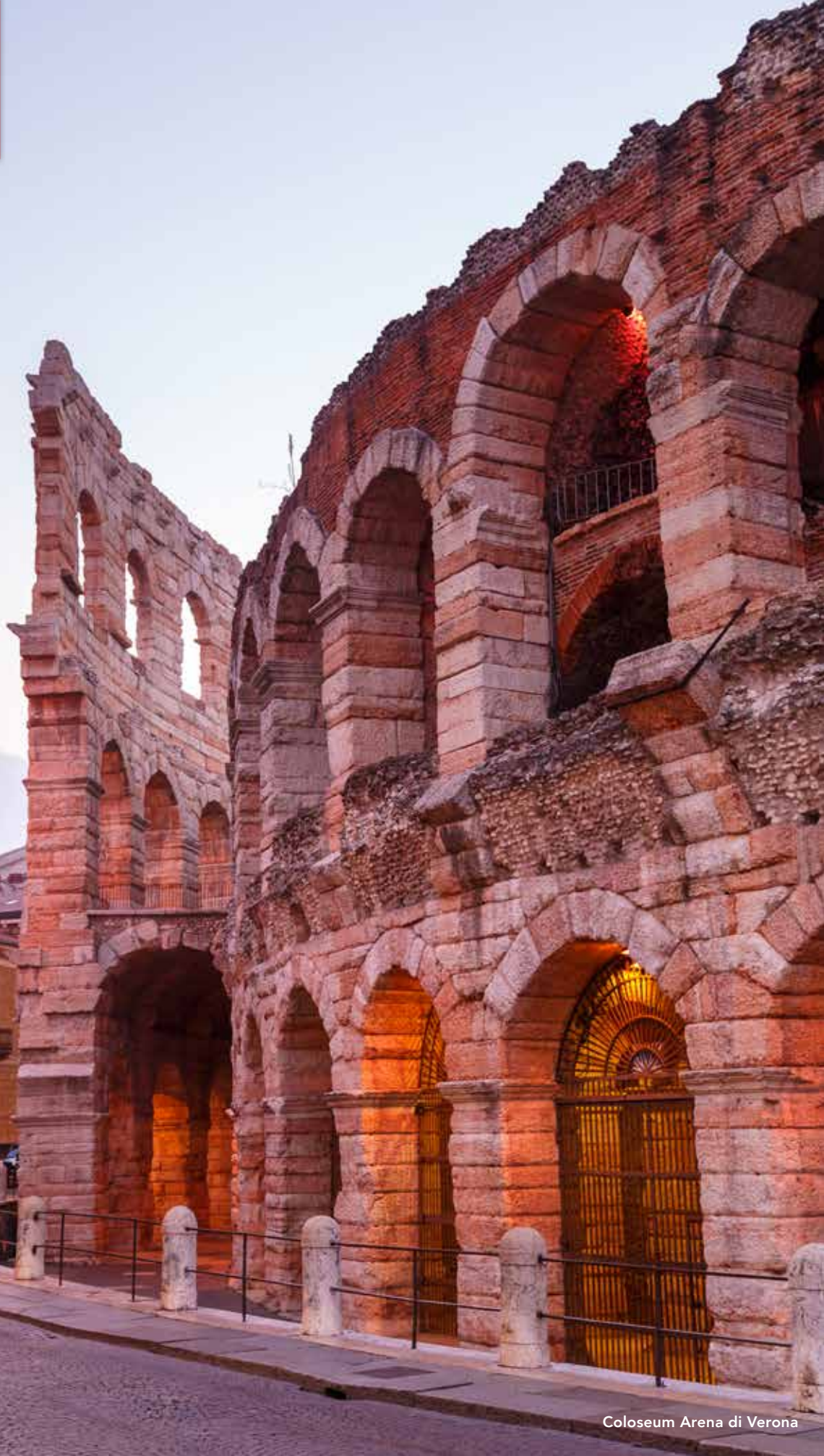
Colosseum Arena di Verona