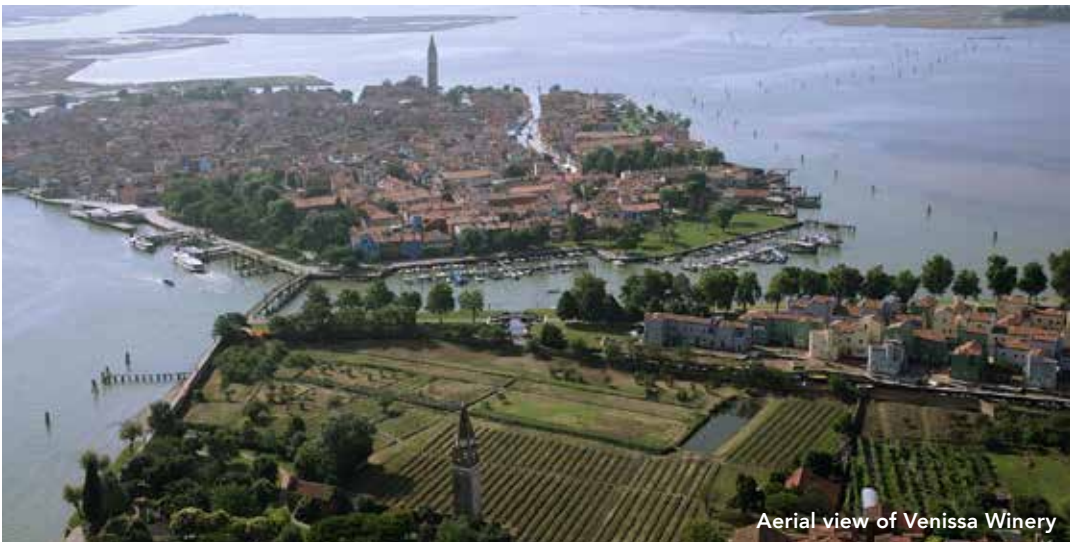
Aerial view of Venissa Winery