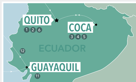
MAPS NOT TO SCALE

ACTIVITY LEVEL: MODERATE TO STRENUOUS Participants should be able to ascend or descend 80 stairs consecutively, plus walk for at least 4 hours over some steep slopes, uneven, and potentially slippery surfaces without difficulty. Physical activities typically last for 4 or more hours at a time.