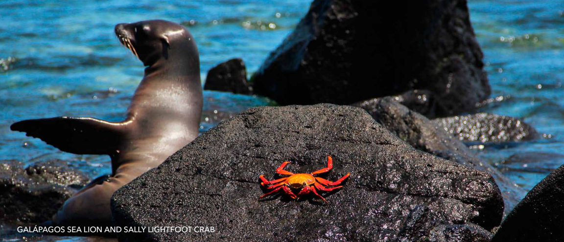
GALÁPAGOS SEA LION AND SALLY LIGHTFOOT CRAB

WHY ECUADOR? Ecuador's remarkable biodiversity is perfect for nature enthusiasts seeking a range of ecosystems and high levels of endemism, thanks to the convergence of the Andes mountains and Amazon rainforest near the Equator, as well as the unique geography of the Galápagos Islands.