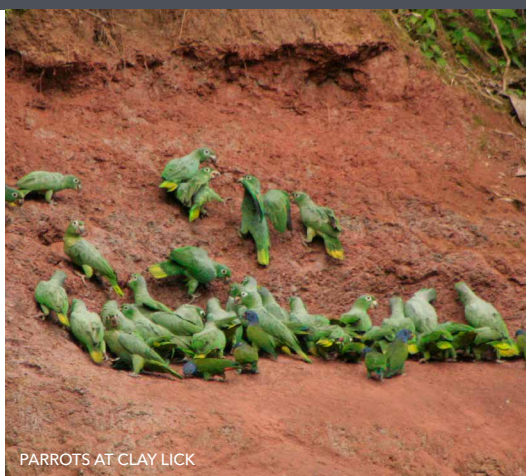
PARROTS AT CLAY LICK

ACTIVITY LEVEL: MODERATE TO STRENUOUS Participants should be able to ascend or descend 80 stairs consecutively, plus walk for at least 4 hours over some steep slopes, uneven, and potentially slippery surfaces without difficulty. Physical activities typically last for 4 or more hours at a time.