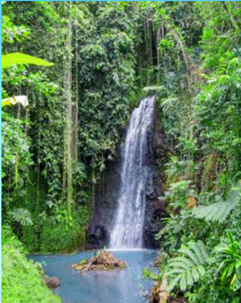
Spring Garden of Vaipahi