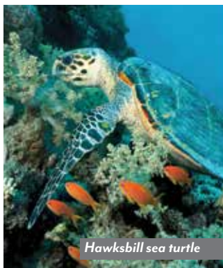
Hawksbill sea turtle

Check into the five-star INTERCONTINENTAL TAHITI and enjoy time at leisure. You may opt to explore