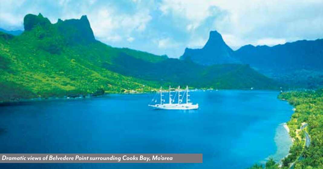
Dramatic views of Belvedere Point surrounding Cooks Bay, Mo'orea