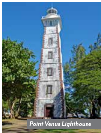
Point Venus Lighthouse

Experience island life on the Bora Bora discovery program with an optional tour on an open-air truck to discover