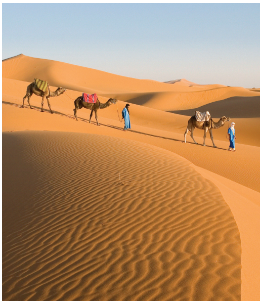
We ride camels in the Sahara.

Day 13: Marrakech/Casablanca We leave Marrakech this morning by coach for storied Casablanca, Morocco’s largest and most cosmopolitan city. After a brief orientation tour of the city, we visit the magnificent Hassan II Mosque, Morocco’s only functioning mosque open to non-Muslims. Tonight we celebrate our Moroccan adventure at a farewell dinner at a local restaurant. B,D