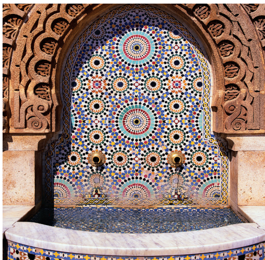
Traditional Moroccan tile work

En route to Marrakech today, we stop first at uninhabited Ait ben-Haddou, a UNESCO World Heritage site and one of southern Morocco’s most scenic villages that is often used as a location for fashion and film shoots. Its old section consists of deep red kasbahs packed together so tightly they appear to be a single unit. Then, as we begin our descent from the High Atlas, we pass through typical villages with fortified walls and stone houses with earthen roofs. In Tizi N’Tichka, we traverse the Pass of the Pastures (alt. 7,415 feet), where life is much as it was centuries ago. We arrive in Marrakech late this afternoon and dine tonight at our hotel. B,L,D