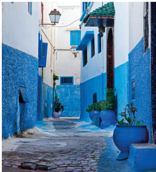
Rabat’s Kasbah des Oudaias

Day 12: Marrakech Our day-long tour includes the beautifully proportioned Koutoubia Mosque with its distinctive 282-foot minaret visible from miles away; the lovely Andalusian-style El Bahia Palace (part of which is still used by the royal family); and the ruins of 16 th -century Palais El Badii. On the way back to the hotel, we stop to see the oldest historical gate of Marrakech, Bab Agnaou, built in the 12 th century. Dinner tonight is at a local restaurant in the city’s Old Town. B,D