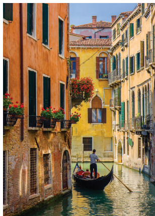
Our tour ends in timeless Venice.

Day 13: San Gimignano We encounter classic Tuscany today as we visit the hill town of San Gimignano, known for the 13 watchtowers that have left its skyline virtually unchanged since medieval times. Later we visit a local winery and enjoy a tasting before returning mid-afternoon to our lodgings, where we have time to relax before tonight's dinner at a local restaurant. B,D