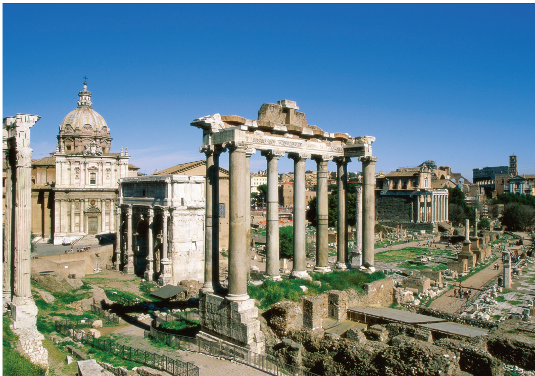
We explore Rome's ancient Forum on Day 6.

building; tossing a coin into Trevi Fountain; or visiting any number of renowned museums and churches. B