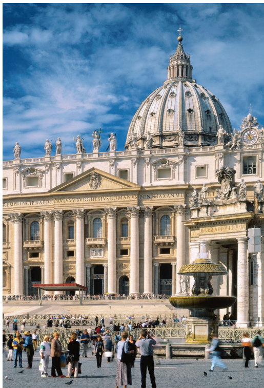
We visit St. Peter's Square and Basilica on Day 7.