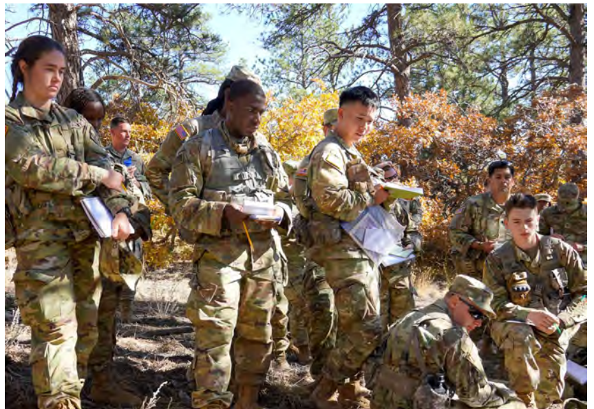
CADETS RECEIVE UPDATED INSTRUCTIONS FOR THE NEXT EXERCISE.

All maneuvers were executed to fulfill the requirements laid out by Cadet Command. Cadets were able to experience the simulated scenarios in a realistic / hands-on manner. This type of “in-the-field” exposure to army combat techniques and unit exercises aid in the overall knowledge and leadership each Cadet builds within themselves. The MSIII Cadets use what they have learned here and apply it to their mandatory Cadet Summer Training (CST) that happens between their junior and senior year.