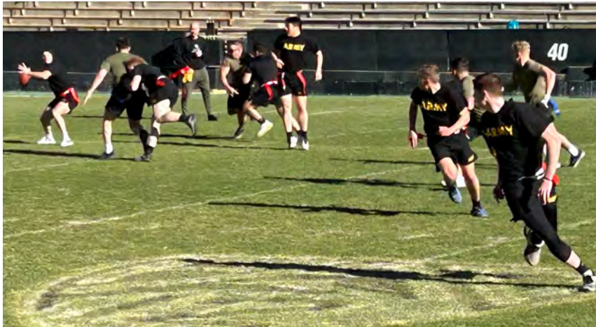
ARMY/NAVY FLAG FOOTBALL GAME ON DECEMBER 5, 2023.

December 5, 2023 was the perfect day for a friendly game of flag football between Army ROTC and Navy ROTC. This year marked the third time these two ROTC units came together on the field. A huge thanks to the CU Athletic Department for giving the ROTC units permission to play on Folsom Field itself. Both teams most definitely brought their “A” game for this event.