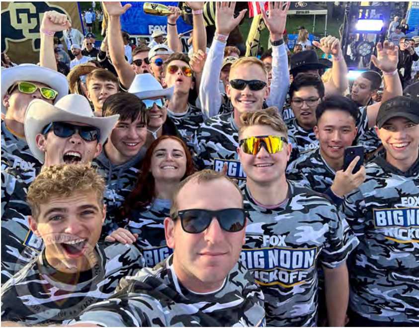
CADET SELFIE TAKEN AT THE FOX SPORTS BIG NOON KICKOFF SHOW.

Our Cadets were ecstatic to be given the opportunity to meet the Fox hosts and actually participate on the live television broadcast during the noon kickoff show. 45 Cadets were able to attend and all received a black and white camo t-shirt with the Fox Big Noon Kickoff logo on the front.