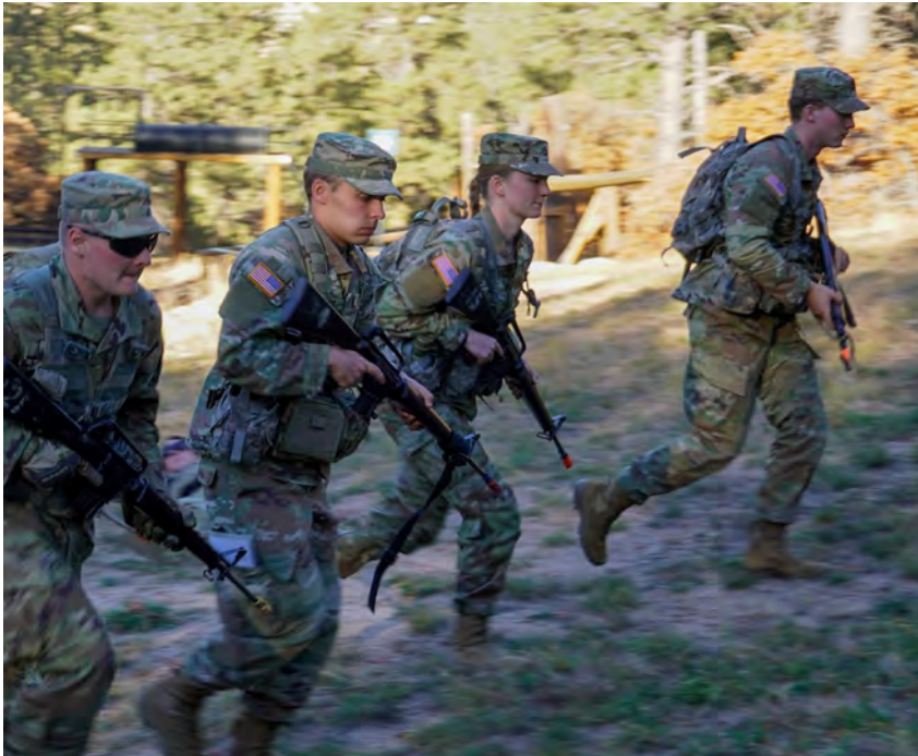
ARMY ROTC CADETS RECEIVE SQUAD INSTRUCTIONS FOR A QUICK MOVE-OUT AND REPOSITION PATROL BASE FRONT LINE.

squad and platoon level movements, and patrol base operations.