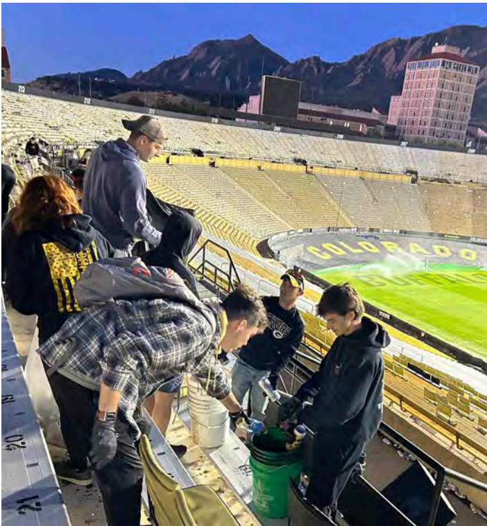
ARMY ROTC CADETS WORK TOGETHER TO PICK-UP REFUSE FROM THE STANDS.

This year (due to certain vendor constraints), the Cadets only had to deal with two bags to throw everything into. After a quick briefing from the Asst Athletic Director of Stadium Operations, the Cadets grabbed bags, donned latex gloves, and got to work.