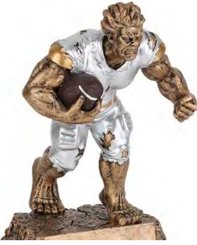
ARMY/NAVY FLAG FOOTBALL TROPHY.

With the ball back into Navy hands, a last attempt was made to put more points on the board. The ball was snapped to the Navy quarterback, who proceeded to toss the ball into heavy coverage. Luckily, Army had a Cadet who had positioned himself in the perfect spot to make an easy interception. Resulting in the last play of the game since the play clock was down to zero.