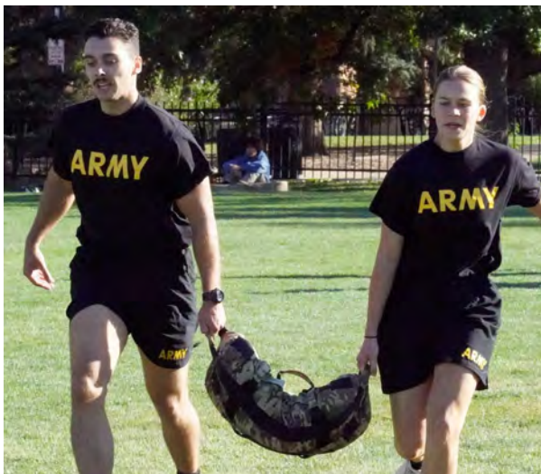
ACO CADETS WORK TOGETHER DURING THE SANDBAG CARRY.

all three military ROTC departments compete on campus (Army, Air Force and Navy/Marines) – Farrand Field – October 05, 2023.