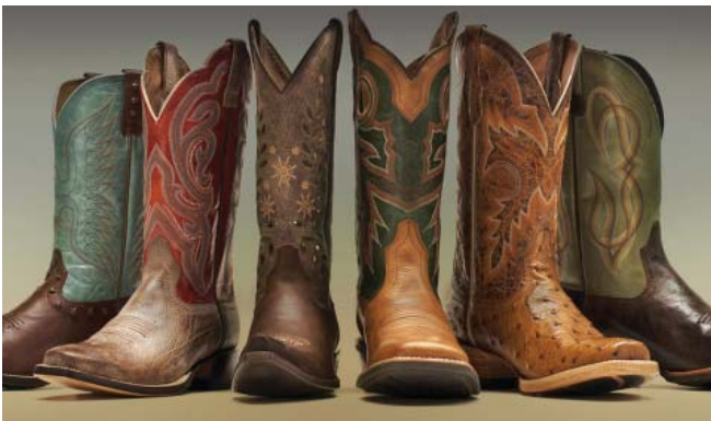
Ariat high performance riding boots

By combining outstanding quality with innovative design, Ariat revolutionized the industry of equestrian riding boots and quickly established a reputation as the gold standard in performance equestrian footwear.