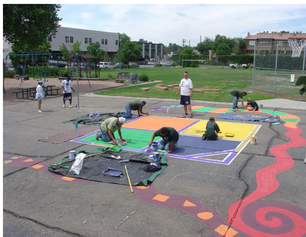
A community work day at a learning landscape playground

funded by the Robert Wood Johnson Active Living Program, examines how the redevelopment of inner-city school playgrounds into Learning Landscapes influences children's physical activity. Three newly renovated playgrounds and three playgrounds that were renovated over four years ago were compared to three playgrounds that have not been renovated. Results show significantly higher levels of physical activity at the six renovated playgrounds. These effects vary by gender. Boys are significantly more