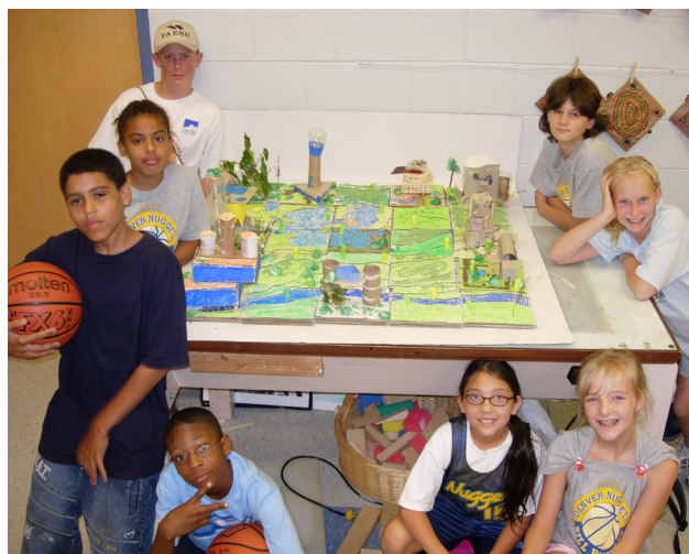
Planning camp attendees presenting their final project.

CYE also partnered with the Gold Crown Foundation in Lakewood, CO, to offer two one-week