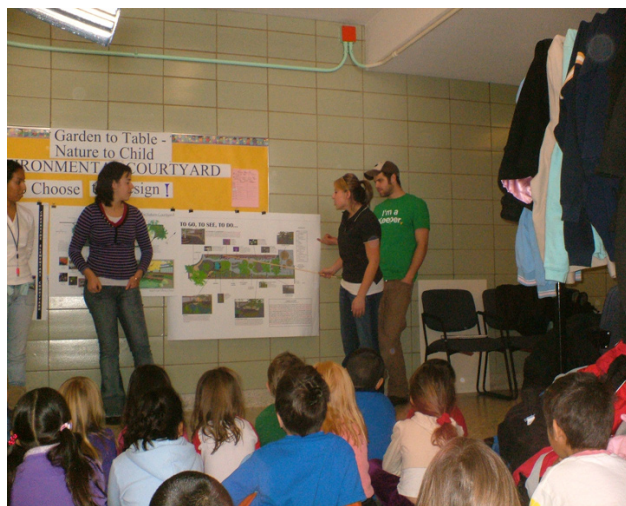
CU students presenting their courtyard design to Creekside elementary school students.

The Center strives to incorporate issues related to children, youth and environments at all levels of the curriculum in the College of Architecture and Planning. These courses are a direct implementation of principles of integrative design that are central to the College's mission. Thus, they are interdisciplinary in their approach and connect education with community outreach and research applied to real world issues. Students have valuable practical learning experiences not available through regular classroom and studio instruction. A good example at the undergraduate level was a course in which PhD students guided environmental design students in working with students at all grade levels at Creekside Elementary School, Boulder, on the collaborative design of the school's