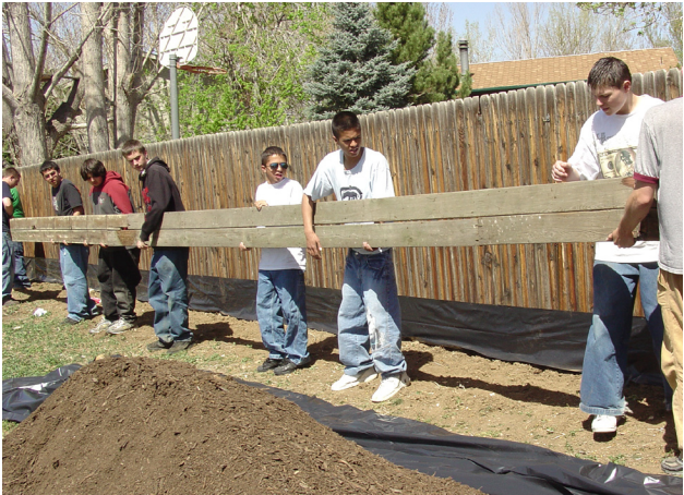
Students at Flatiron Academy build raised garden beds.

cial-needs and at-risk youth in Lafayette, Colorado, to create and maintain a vegetable garden and a straw-bale greenhouse. The goal is to create common ground, literally and figuratively, for the university students and these youth, while including also residents from the surrounding neighborhood, which houses a low-income, minority population, with little public space and few opportunities for growing flowers or vegetables. While the CU students develop a better understanding of the difficult challenges facing others who are less privileged, the garden also offers an opportunity for cross-cultural sharing of practices and traditions in agriculture and food preparation. In addition, it will provide a space for community and school social events, gatherings and celebrations.