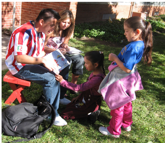
CU students reading nature-inspired stories to two girls at Creekside.

The project found several differences between children and teachers. Children wanted creative, outdoor play, whereas teachers wanted more quiet, directed learning. Children wanted to be able to climb up high, particularly into trees, whereas adults preferred that they do not. The children wanted animals, like chickens that could provide eggs, while teachers wondered who would care for them. But everyone wanted water, and plants to attract wildlife and provide healthy food. And everyone agreed on