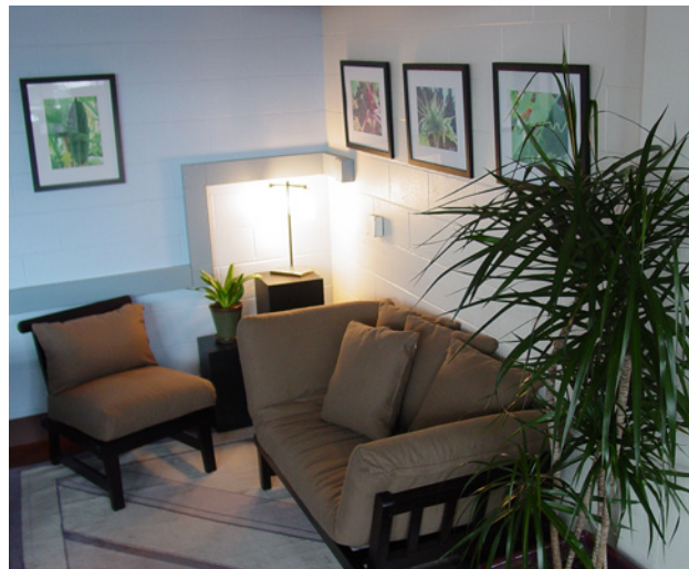
The new lounge space in the CYE Center, room 234 of the ENVD Building.

Emerging approaches in the Center’s activities emphasize participatory action and evaluation, and focus on projects related to schools, local communities and access to nature. A retreat planned for the summer will provide an opportunity to take stock of the Center’s first three years and determine how it can contribute most effectively to the improvement of environments for children and youth in the years ahead.