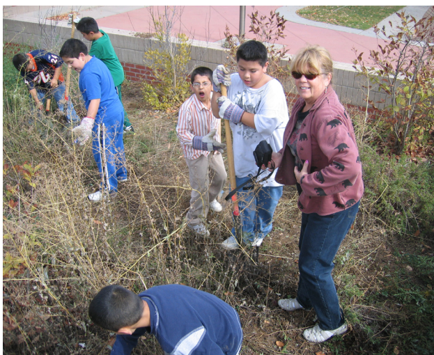
Students help maintain the native landscaping around their school.