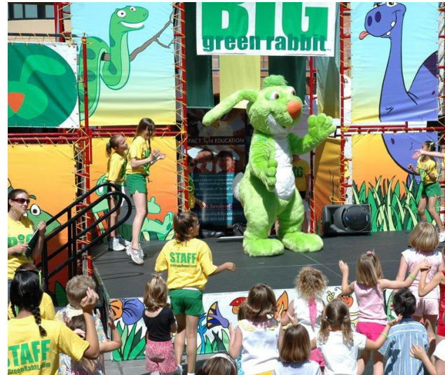
Audition for the Big Green Rabbit™