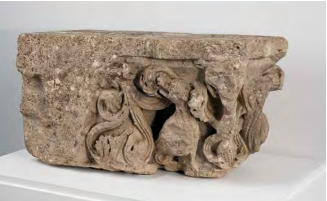
Unidentified artist, French, Capital with dragon-like birds and vegetal decoration , Eastern France, 1150–1199 CE (12th century), Limestone, Purchase with The Carnegie Fund, CU Art Museum, University of Colorado Boulder, 2010.01.