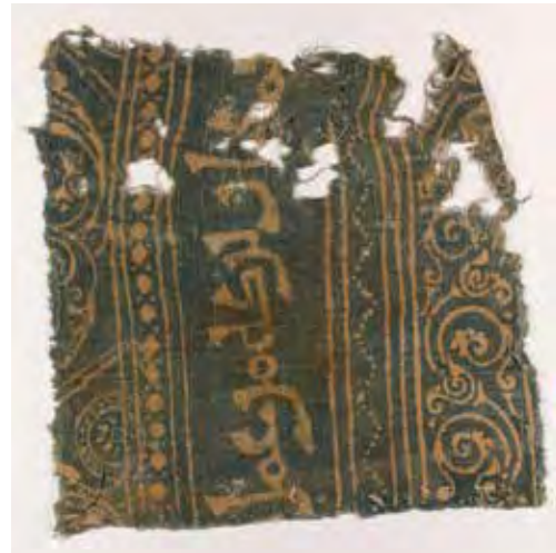
Unidentified artist, Coptic, Untitled (Indigo with Arabic writing), n.d., seventh century, Linen, Anonymous gift, CU Art Museum, University of Colorado Boulder, 2012.06.09. Conserved in 2013.

Andy Warhol , Cowboys and Indians (Annie Oakley) , 1986, screen print, Gift of The Andy Warhol Foundation for the Visual Arts Inc., The Andy Warhol Photographic Legacy Program, 2014.02.06