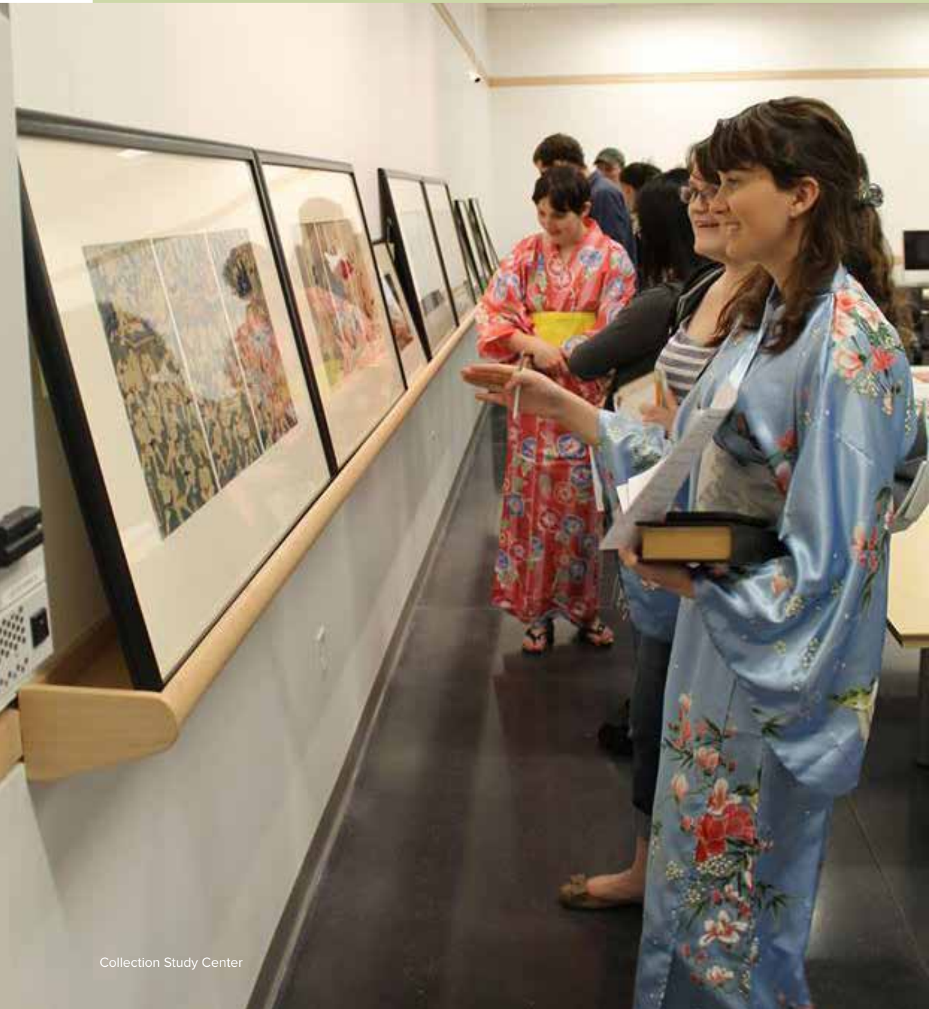
Collection Study Center