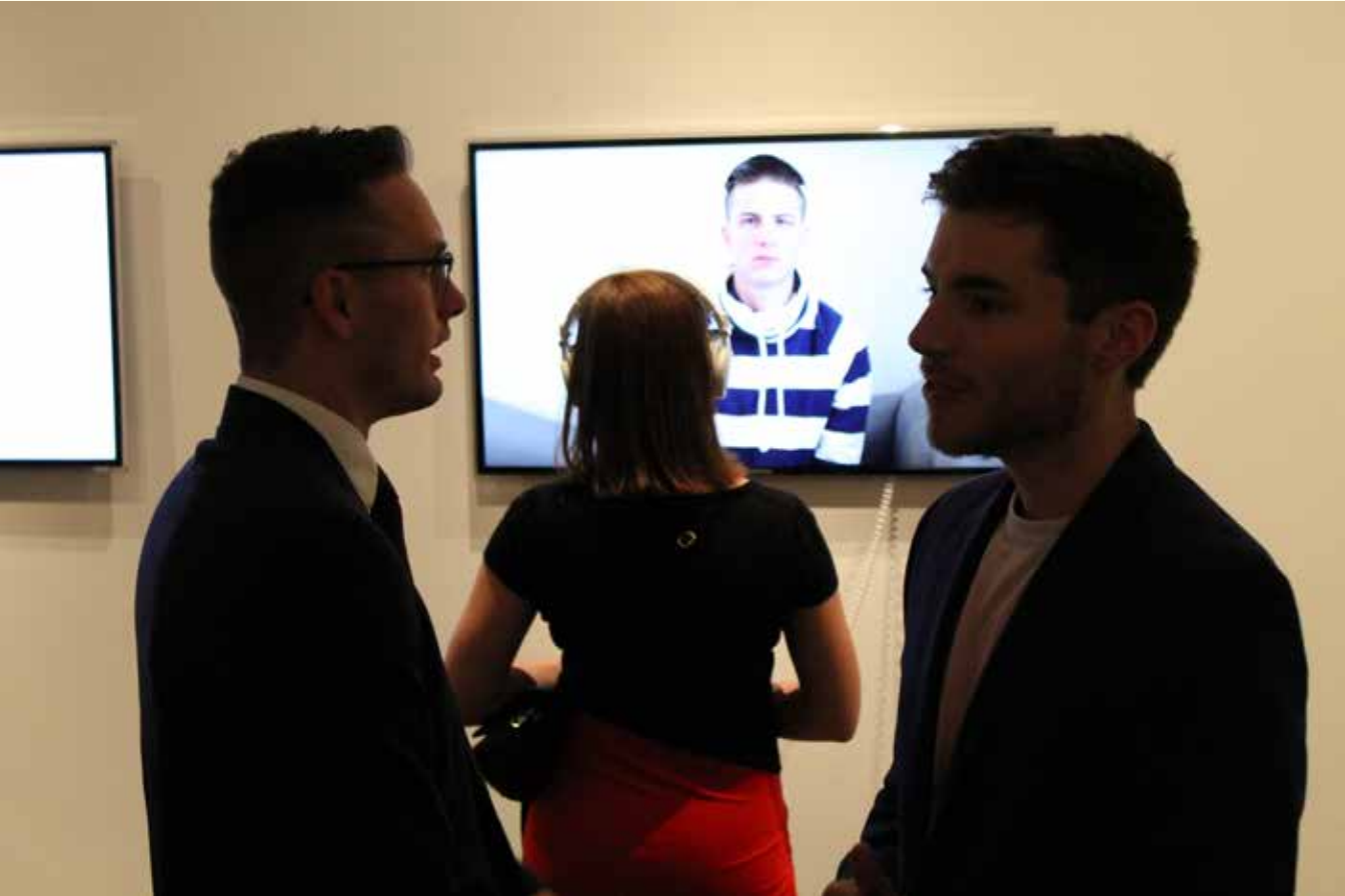
BFA exhibition opening reception