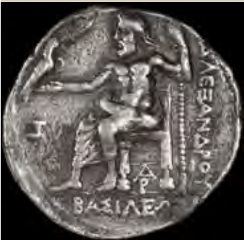
Unidentified artist, Macedonian, Untitled (Head of Herakles in lion's skin r.), 336–323 BCE, Silver, Potential Transfer from the Department of Classics, CU ArtMuseum, University of Colorado Boulder, 2014.06.22.

Our collections were utilized extensively this year: 475 artworks from our collection were on view in special exhibitions and rotations in our galleries, and an additional 188 objects toured regionally and nationally as a part of our traveling exhibitions program. We pulled 340 objects from collections storage for viewing in our Collection Study Center, which was visited by nine different CU departments, 44 classes and 742 students. All in all, students, faculty and the public viewed more than 1,000 artworks from our collection.