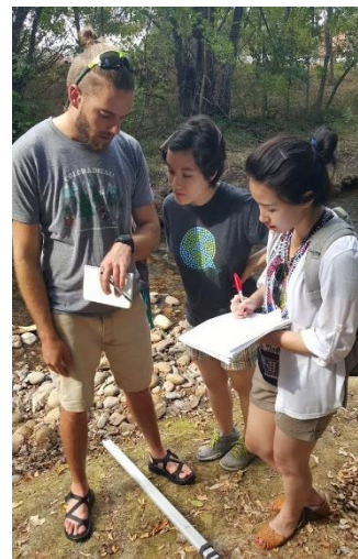
EVEN 4100: Ground Water Sampling, Fort Collins, CO.

Students transferring into EVEN from another of the University of Colorado at Boulder's Colleges and Schools must complete the Intra-University Transfer (IUT) application process . Once the application is approved, credit hours from the non-engineering degree will be evaluated for EVEN credit at the first advising meeting with the EVEN Program Director.