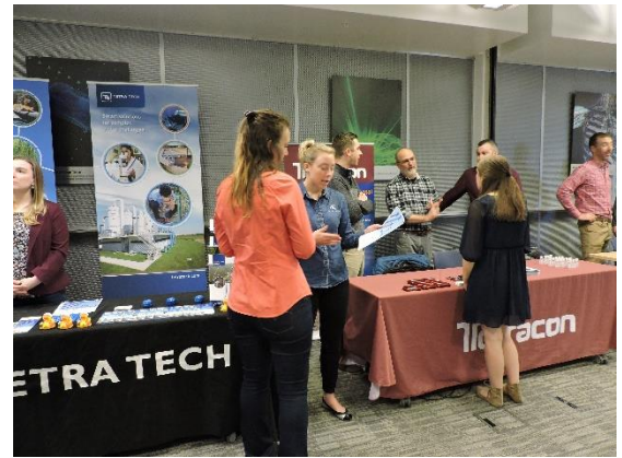
Environmental Engineering and Water Resources Networking Event, February 2019

Once the Office of Admissions has completed its evaluation, the student will meet with the EVEN Advisor for evaluation of transfer credits for the EVEN curriculum. Note that acceptance of transfer credits by the admissions office does not ensure that the transfer credits will count toward the EVEN BS degree; courses taken at another institution must match the course requirements for the EVEN curriculum. In many cases, identification of courses is straightforward; however, for some courses, the EVEN Director may request documentation of course content (catalog descriptions, course syllabi).