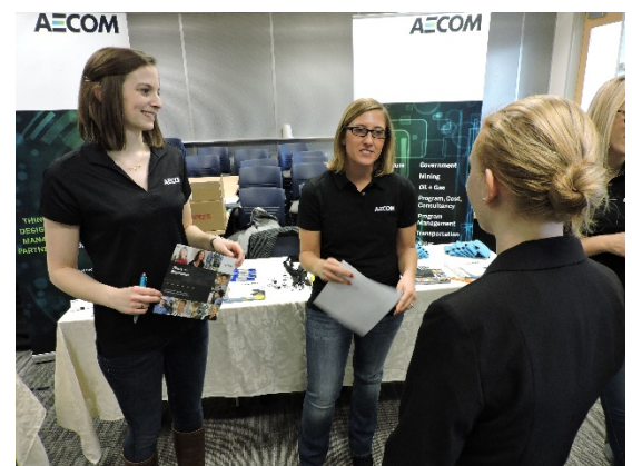
Environmental Engineering and Water Resources Networking Event, February 2018

Advanced Placement (AP) credit may be approved on the basis of College Entrance Examination Board's Advanced Placement tests. International Baccalaureate (IB) credit may be granted to students who have participated in IB diploma or certificate programs. For students who have taken AP or IB courses in high school and who achieve the required score, AP/IB credit will be granted as part of the admission process. AP and IB credits must also be evaluated for credit toward the EVEN curriculum by the EVEN Academic Advisor. If a student later takes a course for which AP or IB credit was granted,