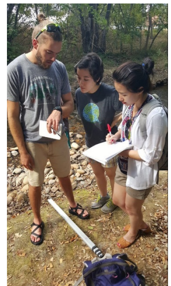
EVEN 4100: Ground Water Sampling, Fort Collins, CO.

Grades of D+, D, D-, F, IF, IW, P or NC do not satisfy this requirement. Successful completion of prerequisite and co-requisite courses will be monitored for all required courses in the Environmental Engineering curriculum. Students who do not successfully complete prerequisite and co-requisite courses must retake those courses before advancing in the curriculum. If a student registers for a course without satisfactorily completing prerequisite courses, he/she will be notified that the course must be dropped and, if necessary, the student will be dropped from the course. Students required to retake courses are strongly urged to consult their advisor for advice on how successful academic performance can be achieved.