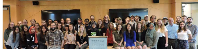
EVEN Senior Design Class of 2018

The Environmental Engineering Program is cooperating with the Department of Civil, Environmental, and Architectural Engineering to offer concurrent EVEN BS/CVEN MS degrees in a five-year curriculum. The purpose of the concurrent EVEN BS/CVEN MS degrees is to allow capable students to gain greater depth of knowledge in environmental engineering by jointly pursuing BS and MS degrees. The concurrent degree program offers students greater flexibility in scheduling technical electives and graduate courses.