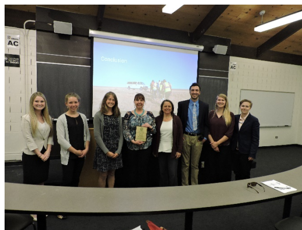
2017 EVEN Senior Design Team wins 1st place at ACRP Competition