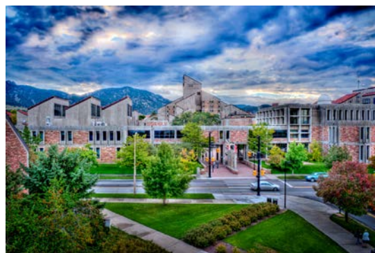
The Engineering Center at the University of Colorado at Boulder.

The proposed EVEN BS degree program was approved by the faculty of the College of Engineering and Applied Science in the spring of 1994. The faculty committee then prepared a full proposal for the new degree program for the Colorado Commission on Higher Education (CCHE), and the new EVEN BS degree program was approved in the spring of 1998. Students began entering the program in the fall of 1998. The first EVEN degree was awarded in December 1999 (to a student who transferred into the program as a third-year student), and the first EVEN class graduated in June 2002.