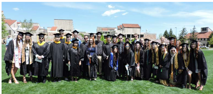
EVEN Graduation Class - May 2018

Graduation will be postponed by failure to complete these requirements. Any exceptions to these requirements will require approval of the Environmental Engineering Program Director and the Dean's office by petition. In addition, students must be recommended for graduation by the faculty of the EVEN Program and the faculty of the college, and should complete the senior survey.