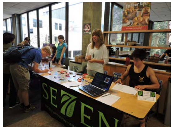
SEVEN, Society of EVEN is a resource for engineering students to connect and explore applications of environmental engineering