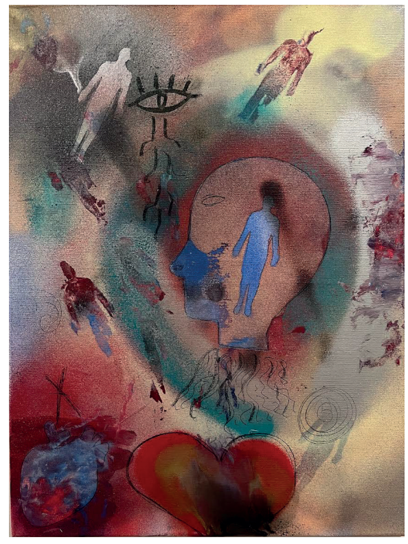
HEARTACHE Lily Karp

"I make art in order to express, ask questions and make the viewer and myself look into their own psychology and everyday patterns of thinking. It is open for interpretation with intentions to look beyond the superficial. Who am I besides a brain in a body?"