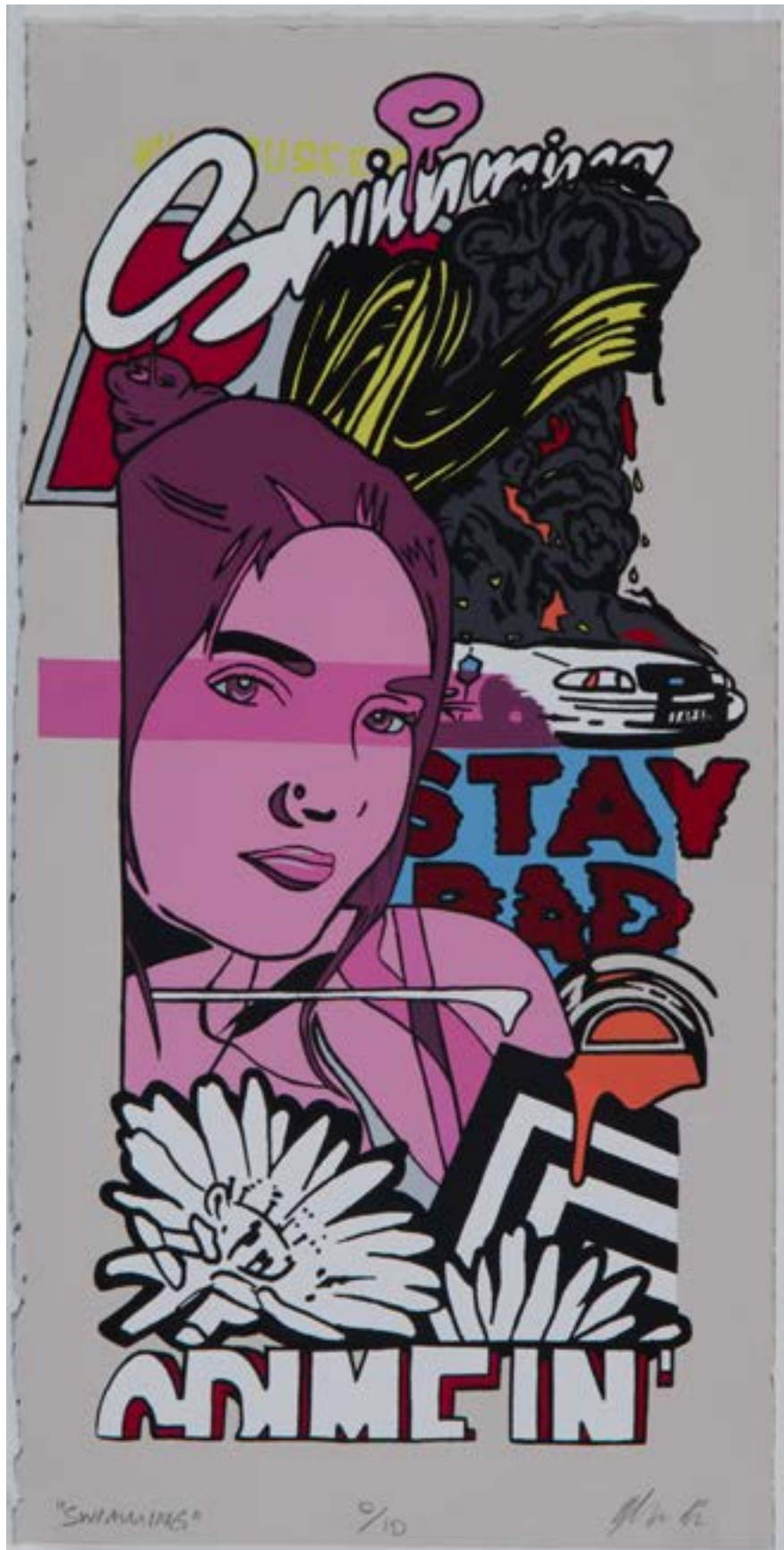
Swimming Graham Fee