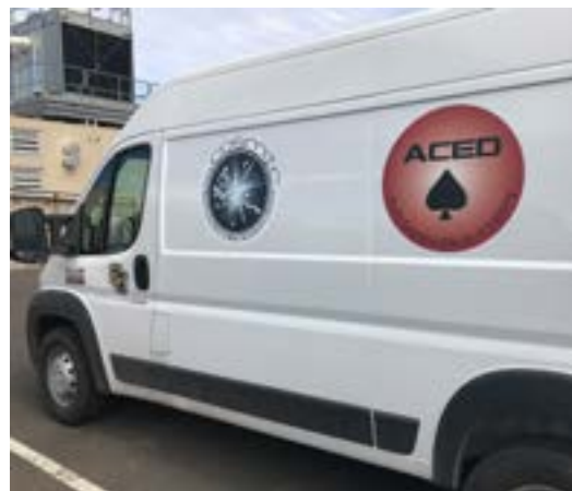
This van is being used as a mobile laboratory for cannabis research.