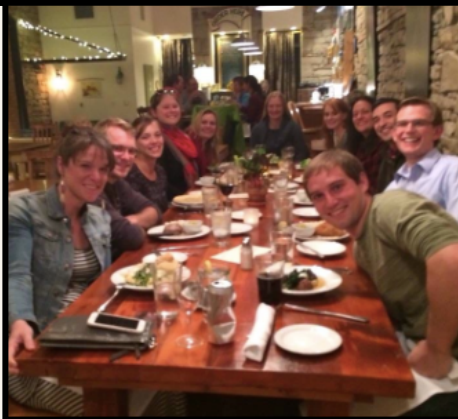
Clinic students dining with the Ute Mountain Ute attorneys in Cortez, CO.

Each year the Colorado Indian Law Faculty adds new classes to the Indian Law curriculum, making Colorado Law one of the top American Indian Law programs in the country.