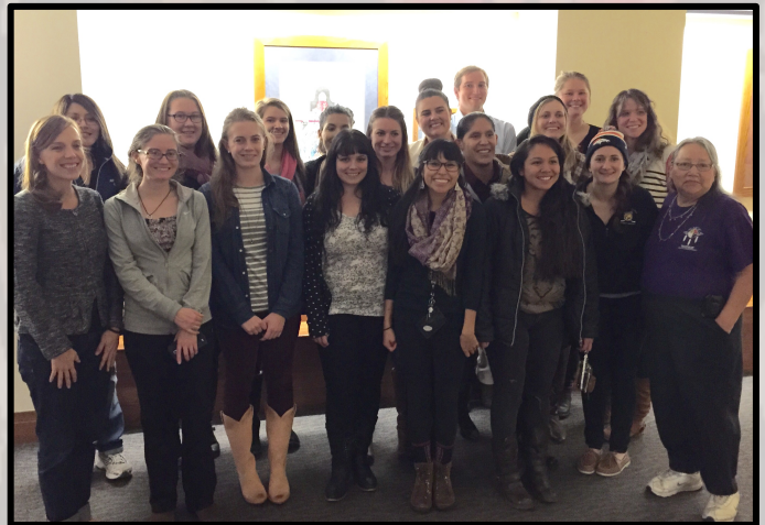
NALSA & Oyate family at the Harvest Feast!