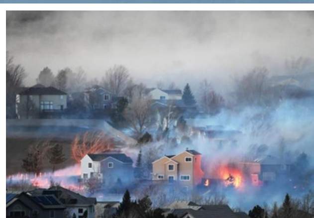
Figure 1: "The Marshall Fire continues to burn out of control near Broomfield on Dec. 30, 2021."

The first goal of our project is to analyze the challenges, and strengths from existing nation-wide community leader models to inform our recommendations. The second goal involves collaborating with wildfire professionals and community members within Boulder County to envision wildfire preparedness on an achievable scale.