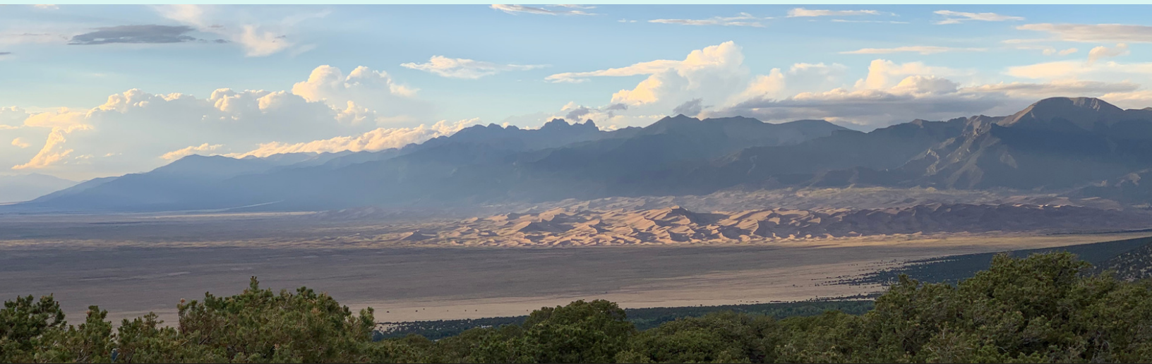
Image 2. Great Sand Dunes National Park in the San Luis Valley on the Capstone team's partner engagement trip.

A brief summary in Colorado's 2024 Statewide Comprehensive Outdoor Recreation Plan (SCORP) to highlight the successes of the RPI and to increase visibility of the RPI