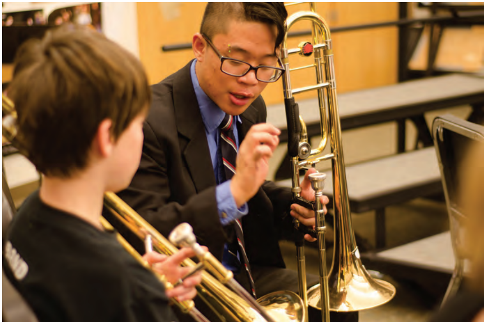
Middle School Ensembles as a Community Partnership

This partnership among public school band and orchestra teachers, the Boulder Children’s Chorale, and College of Music faculty and students provides an additional musical opportunity for local middle school students. Through the program, undergraduates are able to hone their teaching skills, and high school interns learn about teaching music as a career.