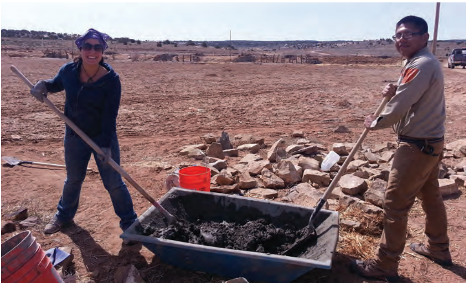
Starting a Worker-Owned Cooperative on Black Mesa

The INVST Community Studies program has worked with the Navajo Nation near Piñon, Arizona, since 1998 and is now working with the nation's Black Mesa Water Coalition to develop a worker-owned women's wool buying co-op. Each summer, CU Boulder students work in the agricultural community and learn about justice and sustainability.