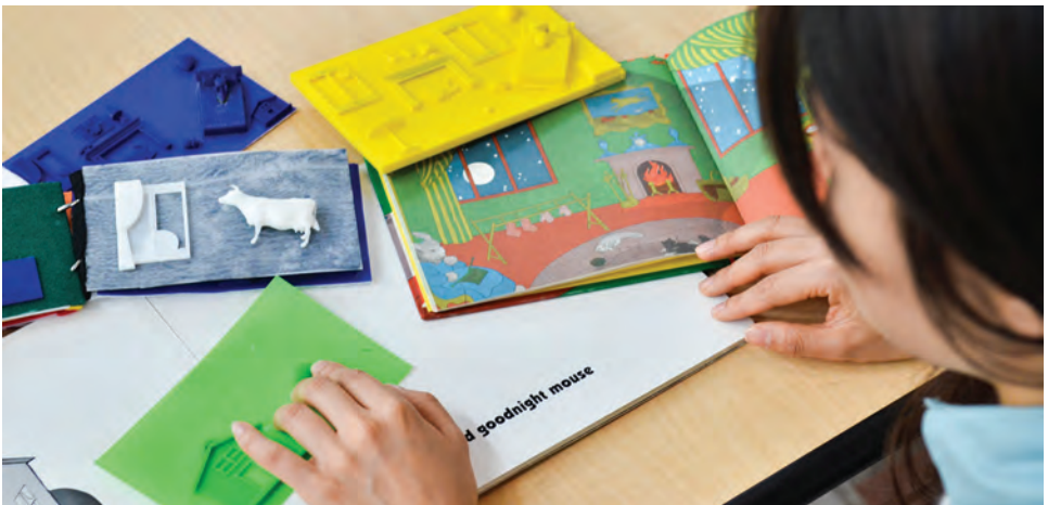
Custom 3D Books for 50 Families Worldwide

The CU Boulder-based Tactile Picture Books Project creates 3D books for visually impaired children with ideas from their families. This year, faculty, staff and students will create books for 50 families, and will involve underrepresented undergraduate students from the Engineering GoldShirt program and the School of Education.