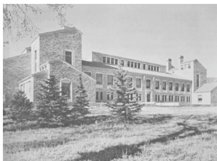
Ketchum Building, 1938