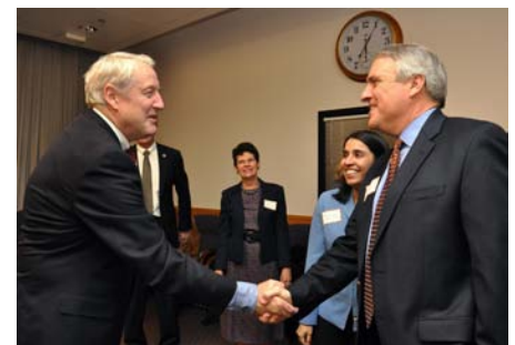
Hank Brown greets Governor Bill Ritter