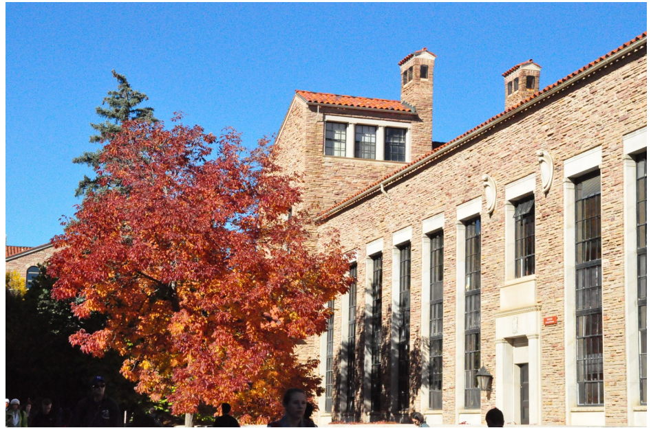
Ketchum Building South Side