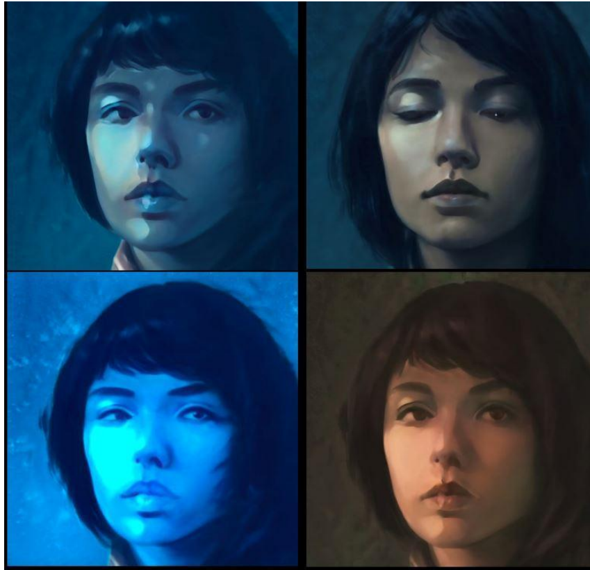
Maya Self Portraits, Created with Artbreeder, an AI GAN tool.