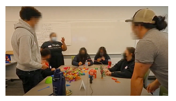
High-school-age youth participants work on a collaborative building project during the second Learning Futures Workshop.

After a successful roll out in the fall with 14 teachers (in 37 classrooms), the Sensor Immersion team has continued to support the implementation of the Sensor Immersion storyline unit in two of our partner school districts with 5 new teachers this semester. In addition to working with these teachers providing profes-sional learning, they are also working with a group of our partner teachers to co-design another Al unit as a follow up to Sensor Immersion