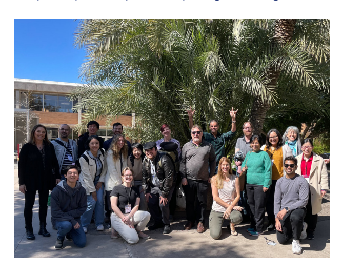
Data Jam attendees pose for a picture after a productive work-

Our Al Partner will need to understand what collaboration looks and sounds like. Enter iSAT's UX Design & Multimodal Modeling theme team, which uses multimodal measurements of teams collaborating to measure and model group collaboration processes. To streamline analyses and obtain diverse perspectives on that multimodal data collected in the iSAT laboratory studies, iSAT researchers helped organize the iSAT-CHART Data Jam at Arizona State University (ASU) in late February. Fourteen iSAT researchers joined seven ASU researchers, each group including faculty, postdocs, and graduate students, to analyze the gaze, verbal communication, non-verbal communication in the datasets. Workshop participants analyzed the data prior to arriving, shared their initial results in a poster session, formed teams organized around five central CPS processes/constructs (influence, linguistic factors, non-verbal interaction, teamness, and dynamics of CPS), and jammed with their teams. By the end of the jam, each team produced plans for completing their jam-inspired analyses and reporting the findings.