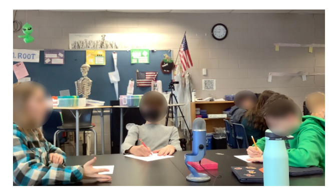
Middle school students collaborate on the jigsaw worksheet during lesson four of the Sensor Immersion unit.

and an efficient tool has been implemented so that annotation