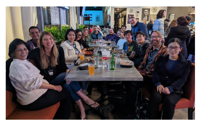
Top: Students, researchers, and staff enjoying a fun night during an iSAT social hour this winter at the Boulder Social.

Bottom: Researchers and students from iSAT and Arizona State University gather to share ideas and conversation during the iSAT-CHART Data Jam.