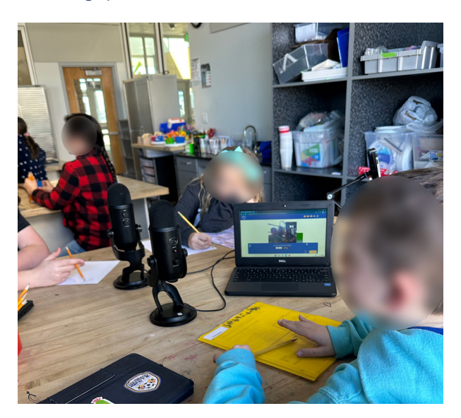
\label{thm:middle} \mbox{Middle school students using the iSAT Researcher Recorder.}

Our team responsible for classroom data collection has been busy in the classrooms doing what they do best—collecting data! Over the course of the 2022-23 school year, they have collected Sensor Immersion curriculum data from 37 classes (14 teachers' classrooms and are adding five more teachers this semester) across two of our partner district schools, and started collecting data on our Games Unit from two additional classrooms. The methods by which they collect include: videos of the classroom using a wide lens camera (Zoom/Go-Pro on a tripod), videos of the teacher with a close lens camera (camcorder and lapel micro-phones), videos of students working in pairs/groups (iPads on stands with Yeti microphones), and student artifacts, perceptions, and demographics. In addition, the team also