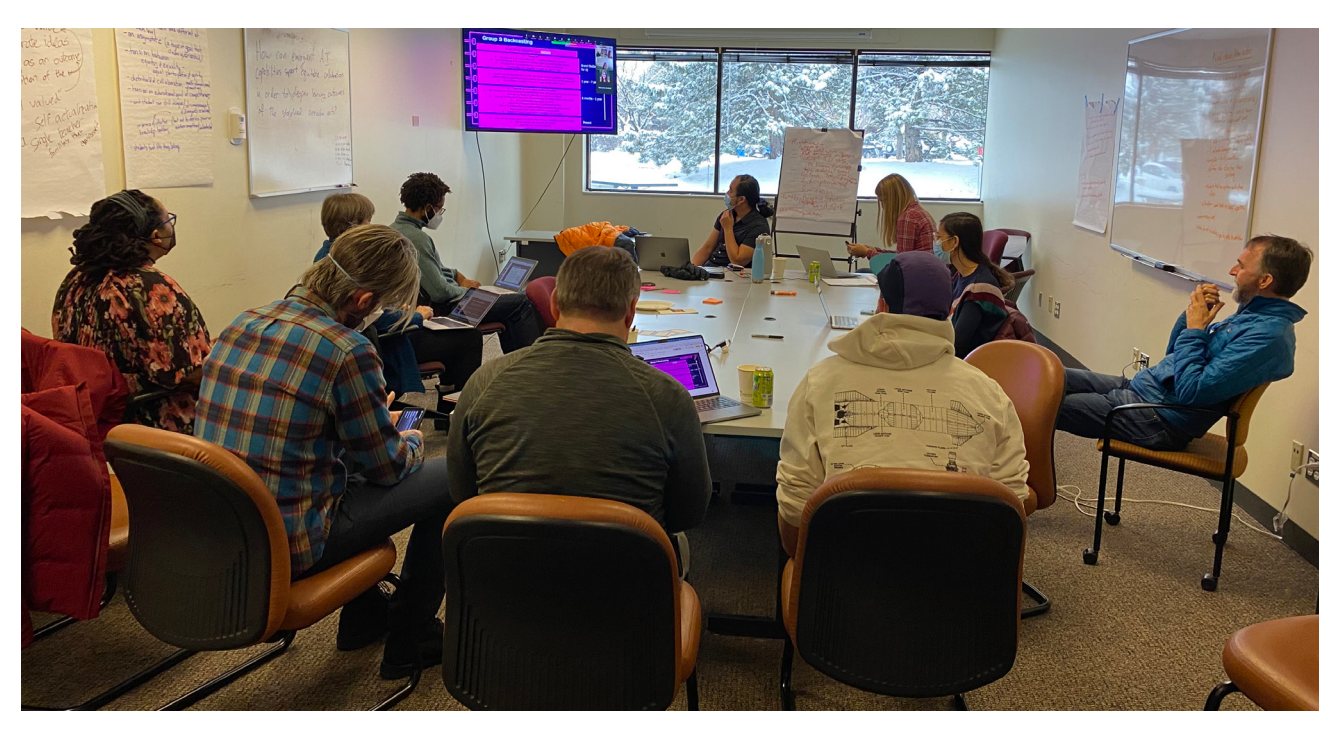
iSAT researchers discuss Group 3's ideas during the Equitable AI Talk workshop.

Group 2 started out with an activity focusing on the group's dreams for an Al Partner. They discussed the question: how does the ideal learning space respond to equitable moments or diverse types of sensemaking such that youth can feel uplifted and welcomed? They concluded that their dream scenario envisions an Al Partner that