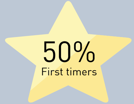
Employee Participation by Year (individuals)